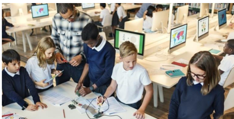
Figure 3. School library media specialist in maker space