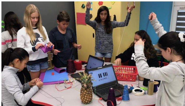
Figure 1. Students in maker space workstation

Thus, a maker space workroom can be seen in Figure 1 below, where everyone is involved in one activity or the others.