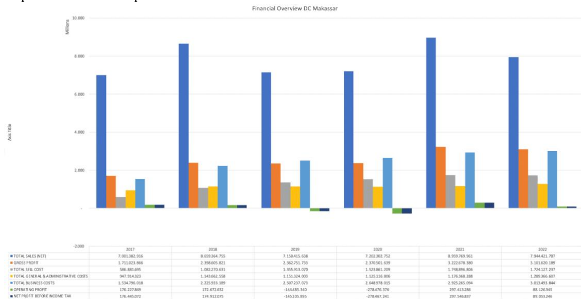
Figure 1 Financial Overview of DC Makassar