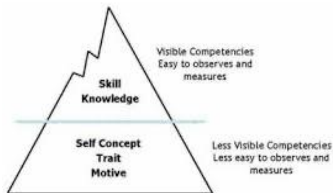
Figure 1. The Iceberg Model

not visible on the surface. Based on Figure 1. below, it can be understood that aspects of skills (skills) and aspects of knowledge (knowledge) are aspects of competence that tend to be visible on the surface so that they are easier to observe, while aspects of self-concept, aspects of personal characteristics (traits), and aspects of motives (motives) are aspects of competence that are hidden and not visible on the surface, so they tend to be difficult to observe.