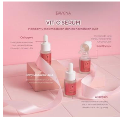
Figure 5. Product Advantages Presented in Image Format