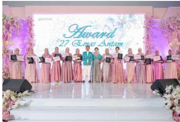
Figure 7. Royal Celebration Award

After careful observation and analysis, the skincare brand Daviena ensures that its customers continue to enjoy the value it offers by consistently improving the quality of its products and services. The brand implemented various strategies, including introducing a loyalty program for consumers and Daviena agents and distributors, a retention program communicated through its social media networks and establishing a community program.