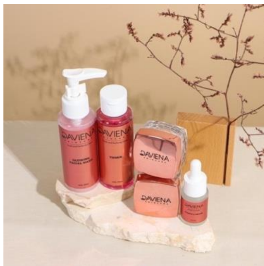
Figure 2. New Luxury and Comfortable Packaging

Based on various insights and past experiences, the Daviena brand underwent changes and developments. In 2020, Daviena successfully obtained legal approval and distribution license from BPOM, resulting in rapid growth that continues to this day. After obtaining BPOM approval, Daviena Skincare expanded its business opportunities by increasing the number of partners. Currently, 22 distributors and 129 agents help sell Daviena skincare products, with market coverage throughout Indonesia. The last record of Daviena skincare products sold was 150 thousand packages (Daviena, 2022b). Furthermore, Daviena's brand development includes packaging updates. Packaging plays an important role in attracting consumers to buy Daviena skincare products.