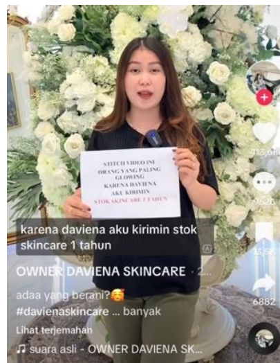
Figure 6. Branding through Giveaway Strategy

Daviena Skincare implemented a marketing strategy through giveaways, offering free skincare products for one year to individuals who stitched glowing skin-related videos on their Tiktok accounts. This approach proved very effective as it resulted in free promotion for the Daviena brand, as people were keen to remix the videos and mention the Daviena brand. It is worth noting that this giveaway was limited to three people. However, the reach of the branding effort was significantly expanded.