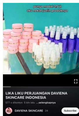
Figure 1. The Beginning of Daviena Skincare