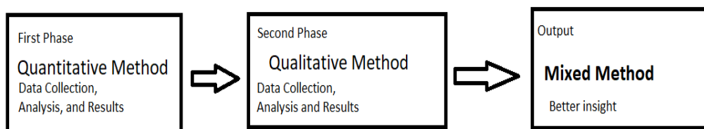
Chart 1. Mixed Methods flow

We will try to elaborate on how Instagram advertising on one of the SMEs named "Instaboost Life" influences their sales with quantitative methods. Main data about budgeting, targeted audiences and their audiences' reach will be shown further in this writing. After we capture the tangible variables, we will also discuss the intangible variables that won customers buying intention through the AIDA model of marketing with a qualitative method. Some data interviews were taken from the customers of "Instaboost Life" will be described in a correlation with Attention, Interest, Decision, Action Model that may affect the buying intentions of customers. Let's say that this writing will use mixed methods to capture the wide view of this study.