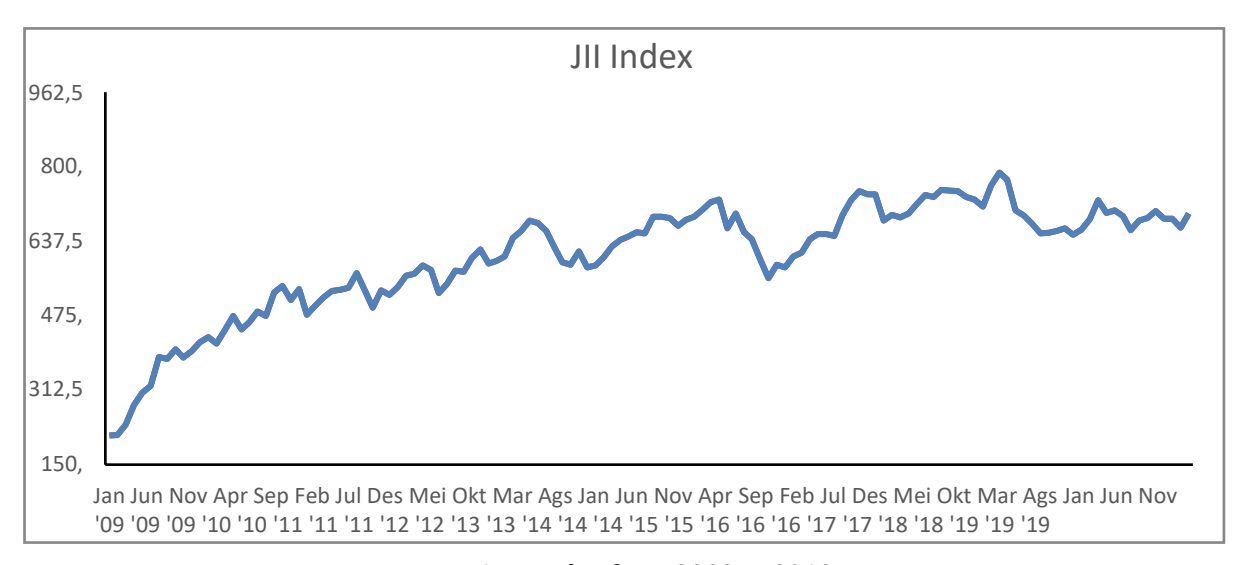
Figure 1. JII index from 2009 to 2019.

Many factors have to be taken into account to determine the value of an asset. Different investors have different preferences in the valuing of these factors. In addition to the local or regional factors, global factors have a strong impact on asset pricing. Asset pricing in the Indonesia Stock Exchanges has different characteristics compared to the developed countries because the majority of the active investors are still foreign investors. Macroeconomic factors that are considered important by foreign investors can be totally different compared to the local investors.