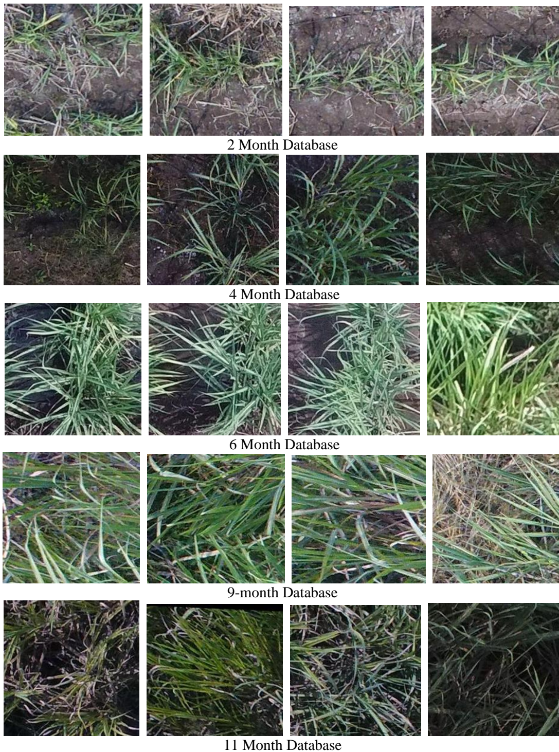
Figure 1. Sugarcane Database