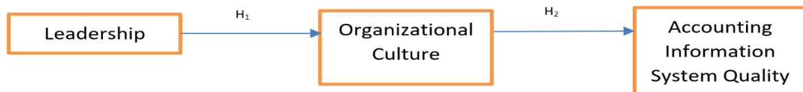
Figure 1. Research Model

H2: Organizational culture impacts the quality of accounting information systems.